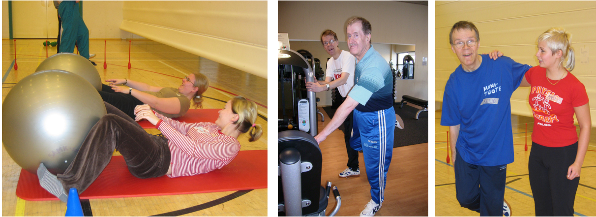
Photos 4–6. Physical activity options offered for Monituote clients