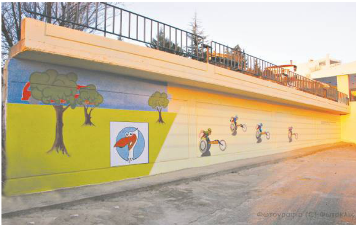
View of the final product of the activity