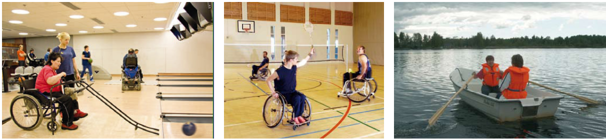
Photos 1–3. Physical activity options offered in Kankaanpää rehab center

mostly group activities (aquatics, chair gymnastics, balance training), individual activities (for example aquatics for severely disabled clients with intellectual disabilities, gym training or bicycling for psychiatric patients etc.), as well as specific programmes for each ward (for example in child or adult psychiatric clients), sports happenings and even activities for out-patients – for example in psychiatric cases. Physiotherapists (53 % of cases), apa-instructors (12 %), as well as other professionals (71 %) were responsible for physical activity. The classification for “other professionals” covered for example assistant physiotherapists [a lower level education in physiotherapy] and assistant nurses [lower level education in nursing]. One third of the respondents considered human resources and time as restrictors for organising physical activity. Attitudes of the professionals were rarely mentioned.