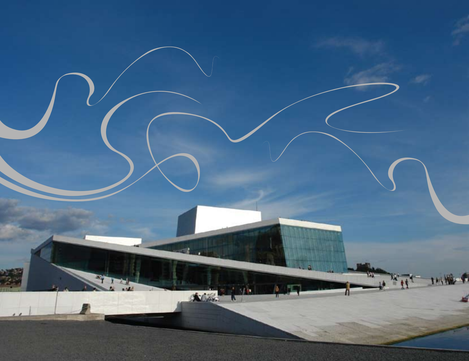
Oslo Opera house

14 th Annual ECSS Congress June 24 – 27 2009 Oslo Norway