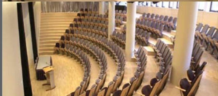
Oslo Congress Centre