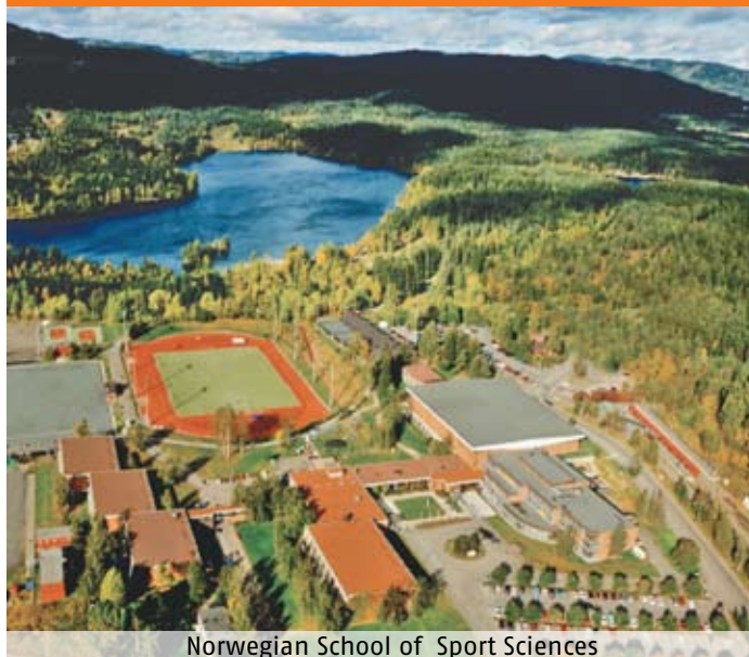
Norwegian School of Sport Sciences