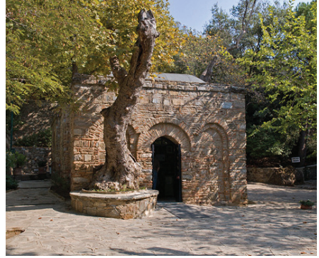
House of Virgin Mary